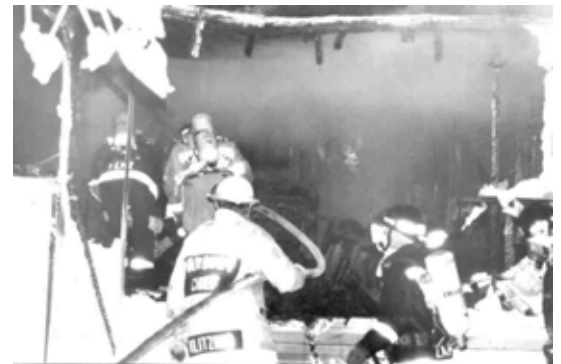
Firemen called out to a trailer fire.

700,000 worth of fire and rescue equipment. Our air packs used to be $1700, presently they run $2200 and we have 20. On the average we have 70 calls per year. We had 6 structure fires and 45 or so bandaide or cloud watchers. Yes, we do storm watches since we do not have an ESDA director. If we have a cat in a tree or a cloud in the sky we do show up. They get all excited and want to do something for $10.00 if its 15 min. or all night to two days. We were known to be foundation savers but today if called in time with 100-500 gal. of water, we can usually put out a house but not if the flames are coming out of the roof. In 1988 our ISO rating was 8 in town and 10 in rural. Two years ago we went to a 4. (10-bad and 1-best). This is kind of unheard of for an all volunteer fire department. The purchase of equipment, new water towers, mains and looping water mains all helped. Our concerns are for the elderly, schools and business. The rural protection dist. has helped with trucks, equipment and the location of 5 dry hydrants in ponds and creeks for water supply where we hook up a truck and suck water from them. We go hand in hand to make the fire service work. We always say . . . faith, family & fire come first. When the pager goes off we go into a different world. Our adrenaline rush makes us do our jobs without fear usually.