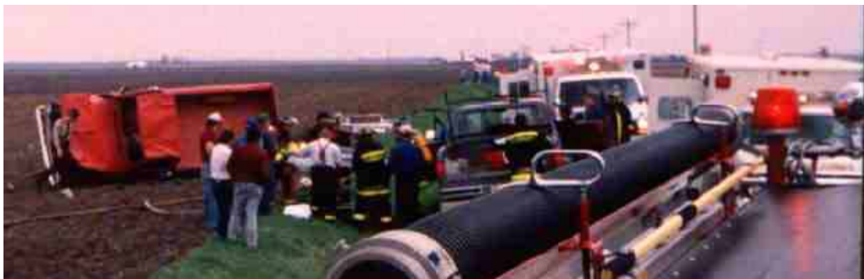
The Fire Department had a call for a truck over turned.